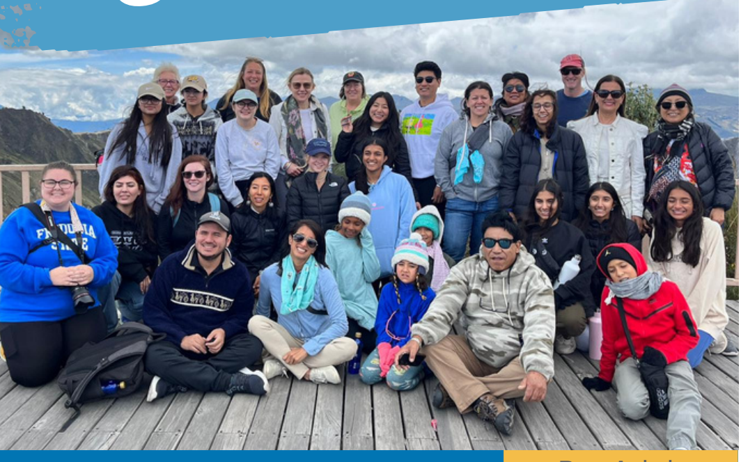
Day 1: Arrive to Quito