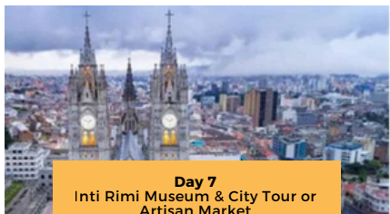
Day 7 Inti Rimi Museum & City Tour or Artisan Market