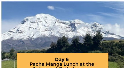
Day 6 Pacha Manga Lunch at the Jatun and Culta Lagoon