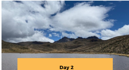
Day 2 Cotopaxi Lagoon Hike