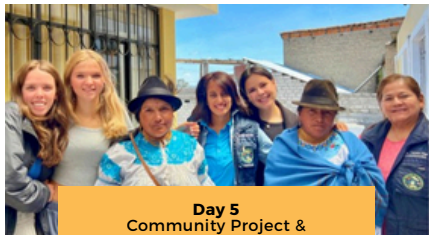
Day 5 Community Project & Tour of Chimborazo