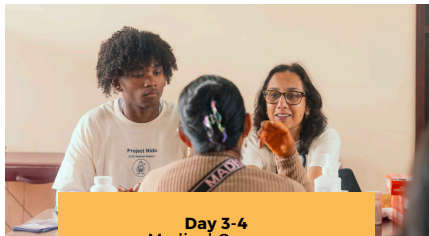
Day 3-4 Medical Caravan